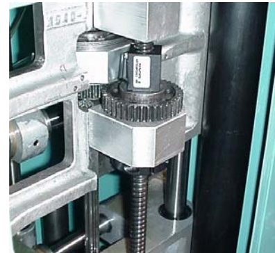
Automatic Stack Height Adjustment

Stator O.D: Max. 8.0 in (203mm) Stator I.D: Min. 1.56 in (40mm) Std. Centerpost Min. 2.0 in (51mm) Cut & Clamp Stack Height: Min. .80 in (20mm) Max. 6.0 in (152mm) Coil Height: Max. 2.0 in (51mm) (Subject to Options Selected) Stitch Rate: 125 per minute Changeover Time (in minutes): 5 to 8 (to change standard centerpost) 8 to 12 (to change cut/clamp centerpost) 3 to 5 (to change OD) 3 to 4 (to change stack height) Motor: 1HP AC or DC (.8 kw) Air Supply: 80 psi (5.5 bar) Weight: 1500 lb (680 kg) Dimensions: Length 57 in (1448mm) Width 52 in (1346mm) Height 63 in (1600mm)