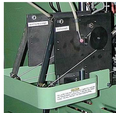
High-mount Electronic Cord Tension