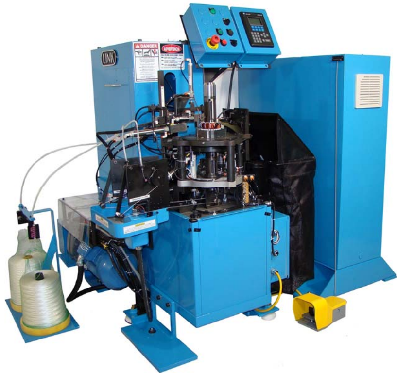
Model 942 Double End Stator Lacing Machine

An air brake is coupled with the horizontally mounted DC motor and gear reducer to provide smoother, quieter operation. Automatic cord tension control is achieved by using an Electronic Tension Head, and the Link Model 1355 sequence controller.